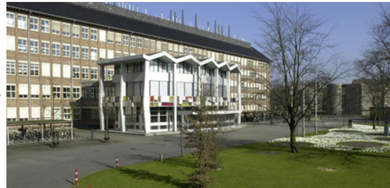
Research responsibility (independence)