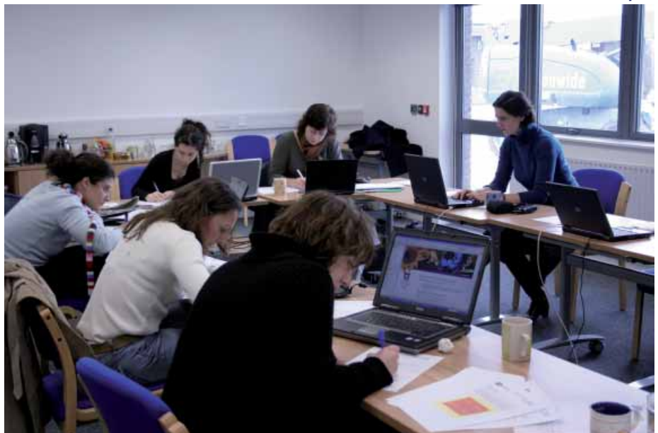
Practising their writing skills.