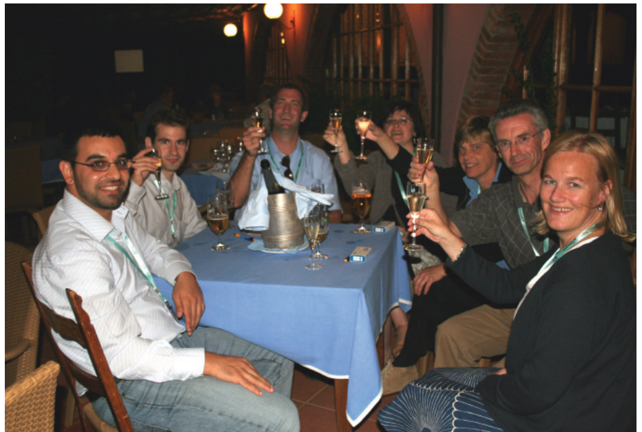
Proud quiz winners: a great example of multi-national collaboration!

Topics covered in the session on new and emerging zoonoses concerned mostly viral diseases of increasing concern due to their zoonotic potential and rising number of human cases. The presentations demonstrated clearly that only the combined efforts of veterinary and human experts will allow the timely detection of viral strains that can switch from animals to humans through food or direct contact. The Med-Vet-Net Workpackage 31 results were included in five presentations summarizing development of databases comparing hepatitis E virus (HEV) genomes from humans and swine, and seroprevalence surveys of HEV and tick-borne encephalitis virus in different countries. Three studies dealt with new threats related to well-known bacterial strains with established zoonotic potential: verotoxin-producing Escherichia coli (VTEC) and multi-drug resistant Salmonella enterica Phage Type U311. The authors stressed the need to develop different surveillance models to integrate epidemiological and advanced bacteriological methods allowing close monitoring of new virulent bacterial clones. This in turn will allow timely