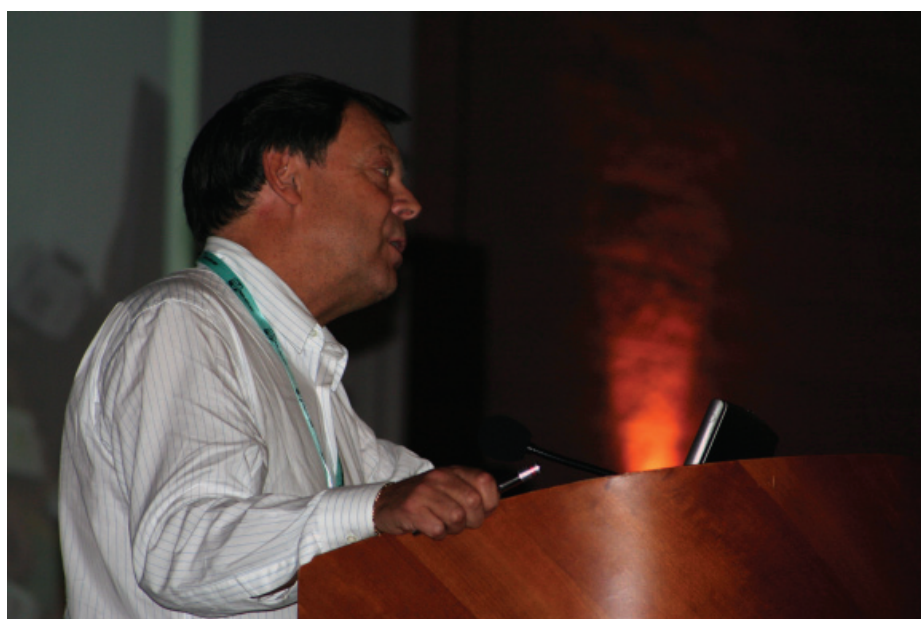
Professor Sir Howard Dalton speaking on 'Effects of climate change on infectious diseases'.

The session demonstrated some useful results which came out of Med-Vet-Net workpackages in a broad perspective covering detection of bacteria, viruses, and parasites in view of food safety.