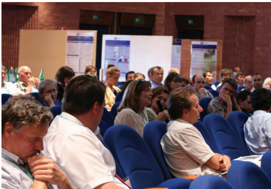
Audience questions for the panel discussion on 'What are the future challenges for zoonoses research and surveillance in Europe over the next 10 years?'

On their way home, participants acknowledged having