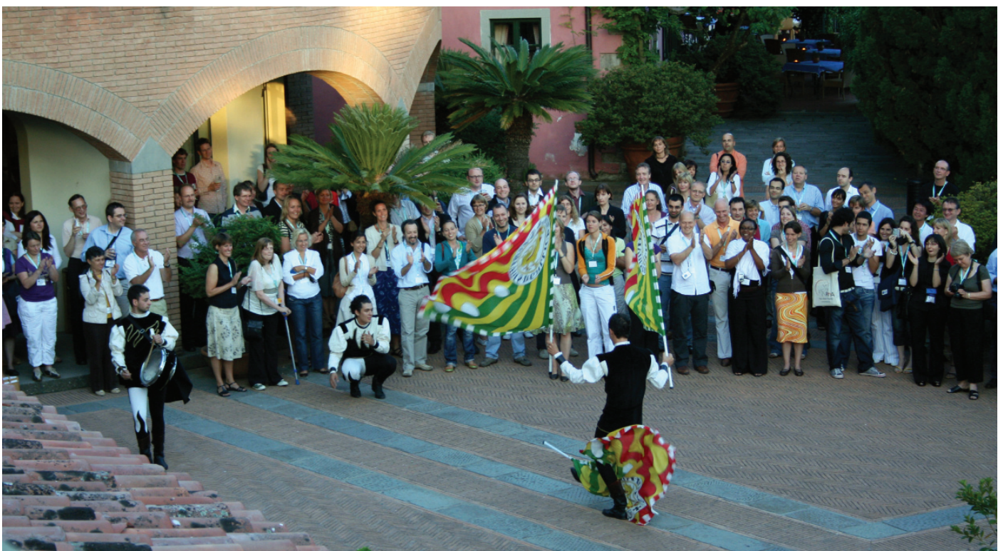
A tradition ‘flag waver’ from the local troupe shows off his skills to the meeting participants.

Finally, a German study summarizing a hantavirus outbreak investigation from 2005, stressed the need to monitor closely known zoonoses which can re-emerge due to changes in climate and the environment.