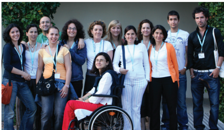
Delegates from ISCIII in Spain