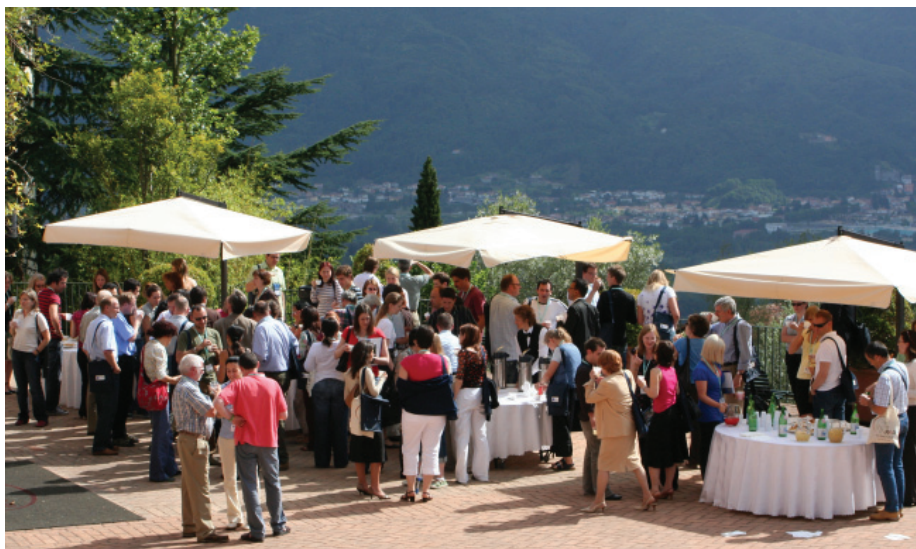
Coffee breaks on the terrace with views of the Tuscan mountains.

Apart from these studies, we had the opportunity to hear some results of the