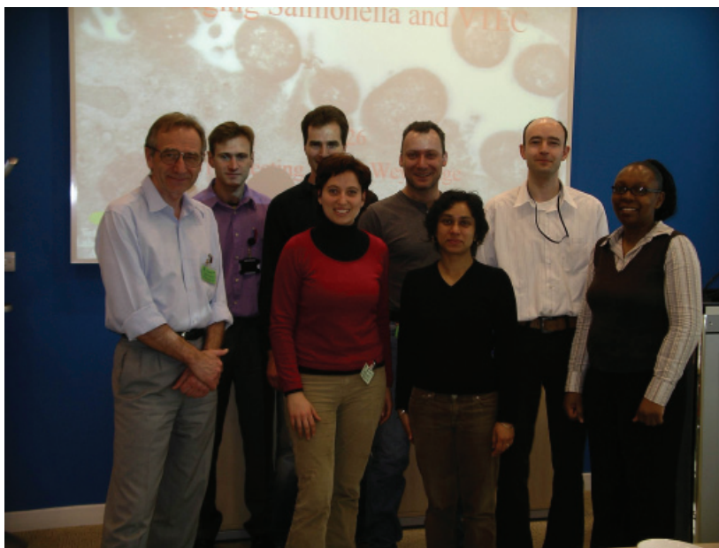
Participants at the Workpackage kick-off meeting in April.