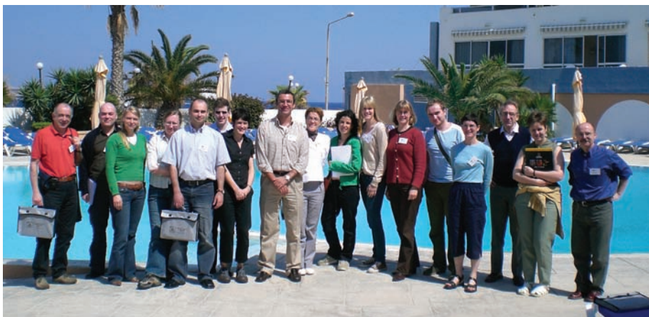
The kick-off meeting of this Workpackage was held on 6 May 2006 in Malta.

Consistent with this concept, research on antimicrobial resistance remains a milestone in the battle against infectious diseases in the developed world. Recently, a new family of aminoglycoside resistance determinants,